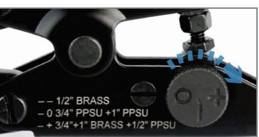
ADJUSTABLE CUTTING DEPTH No damage to the fitting